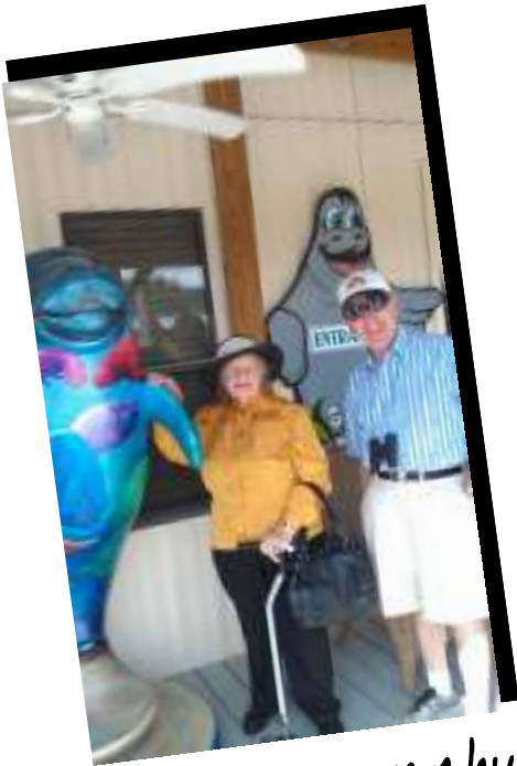
The manatees were huge!